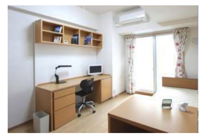
94 fully-furnished rooms for undergraduate and graduate students, located in central Nagoya near Tsuruma Park, Osu Kannon and Sakae district

2-24-37 Chiyoda Naka-ku, Nagoya-shi, Aichi-ken