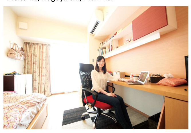
198 fully-furnished rooms for undergraduate students with a great mix of Japanese and international students, located in eastern Nagoya

543 Takama-cho Meito-ku, Nagoya-shi, Aichi-ken