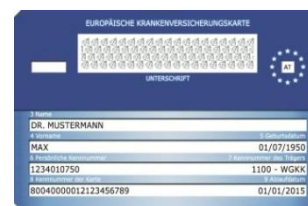
European Health Insurance Card

EU-students are normally sufficiently covered by their national insurance plan. Please submit a copy of your European Health Insurance Card (front and back page) valid for your entire exchange at EBS.