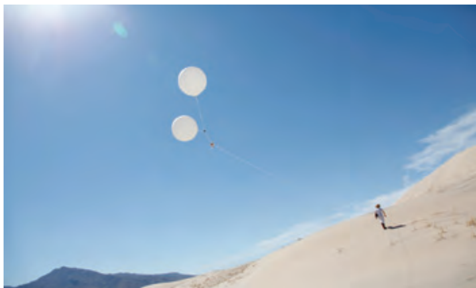
School of Creative Media students 'read' nature to produce artworks created in and by the Mojave Desert.

The goal of DEC is for all students to have the opportunity to make an original discovery – a discovery, innovation or creative project that represents new knowledge in their field.