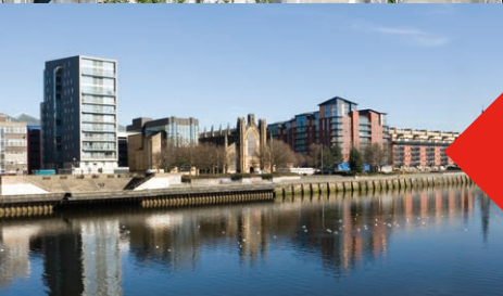
The River Clyde waterfront