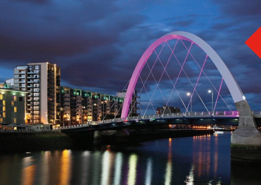
Glasgow at night