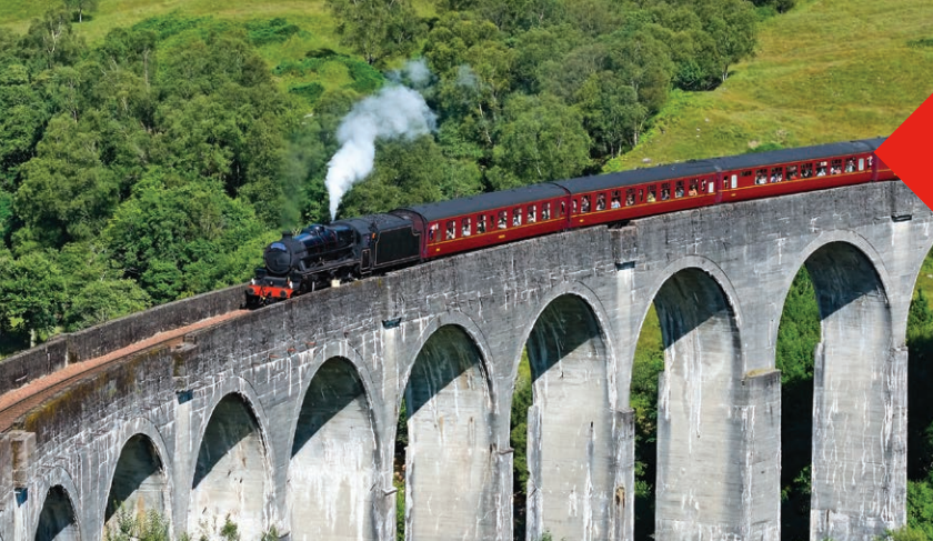
Steam train over Glenfinnan viaduct, as seen in the Harry Potter films